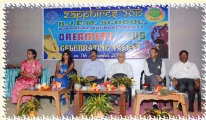
Zapphires- Dreamers' Club Annual Function-2015