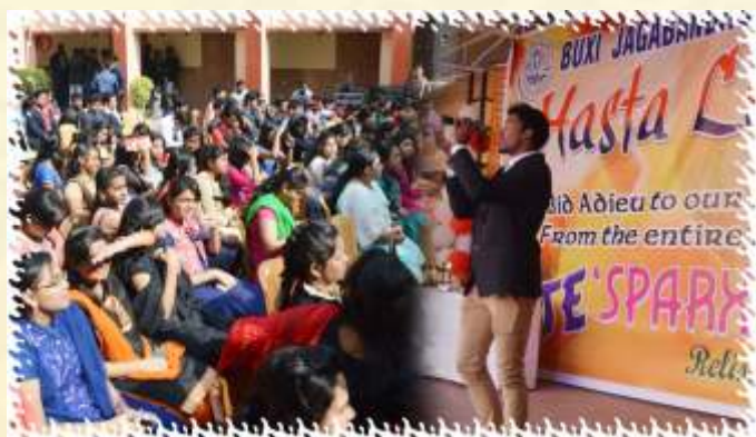
Heart filled farewell "Hasta Luego" to students of Std.- XII